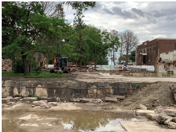
Removal of demolition debris from St. Katherine building completed