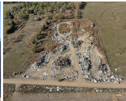
Unregulated Dump Site