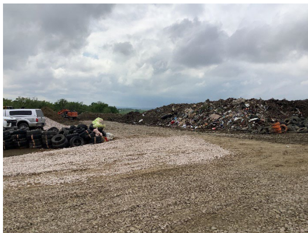
Gravel placed to stabilize the road at repository