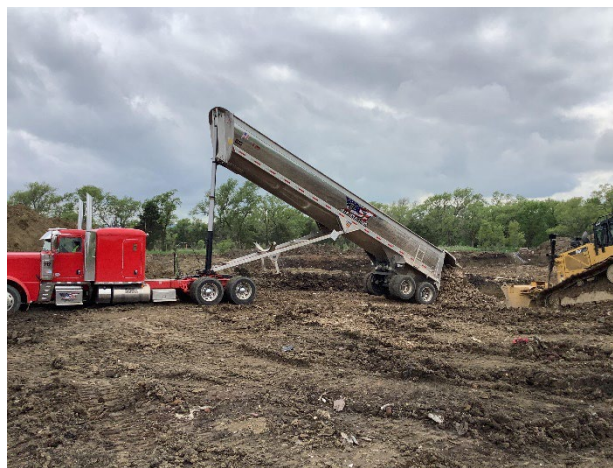
Haul truck off-loads debris into repository