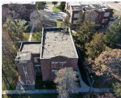
St. Joseph and St. Katherine

The unregulated dumping location is used dozens of times each day by people and businesses from as far away as Nebraska and often catches fire.