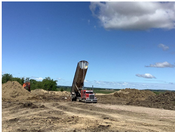
Haul truck off-loads debris into repository