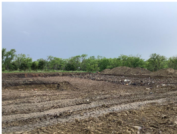
West side of repository