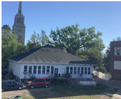
White Frame Building