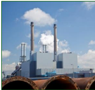
Coal/Oil Electricity Generation