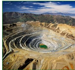
Certain Mining Facilities