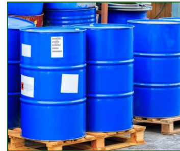
Hazardous Waste Management